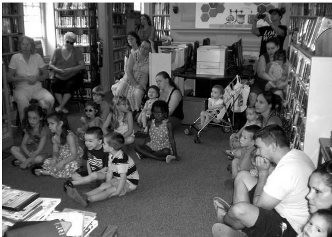
The Claverack Library filled to capacity with children at a successful program this summer.

As for the new Library, work continues with the installation of the elevator. Plans are being laid for future phases of improvements and the trustees are working to raise the necessary funding. Visit the New Building tab on the Library's website — www.claveracklibrary.org — for progress updates and to contribute. Every donation helps assure that more records will be set as your Library better serves the community.