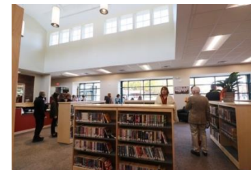
We look forward to being together again in our library.

Since our grand opening in October, 126 new patrons have been issued library cards, with an additional 16 signed up since the building closed in mid-March. Our director and library workers have gotten creative by generating original online content such as pop-up story hours, remote book clubs, and wellness classes and facilitating the sharing of all sorts of digital resources, all to help ease the burden of isolation and underemployment.